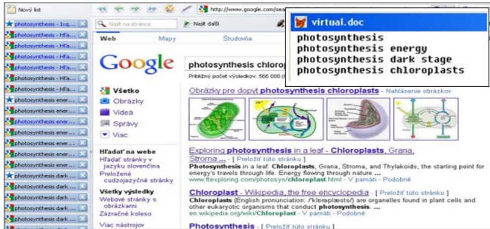
Figure 2. Example of batch retrieving (a screenshot within OPERA).